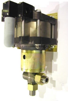
GSF35 (L) single acting, single air drive head with distance piece (Standard= Bottom inlet)