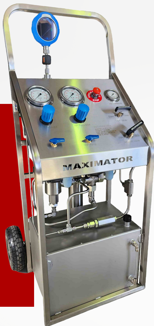
Maximator MPU with optional Data Logger.